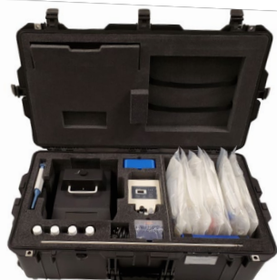
Custom Pelican Roller Case for Easy Transport