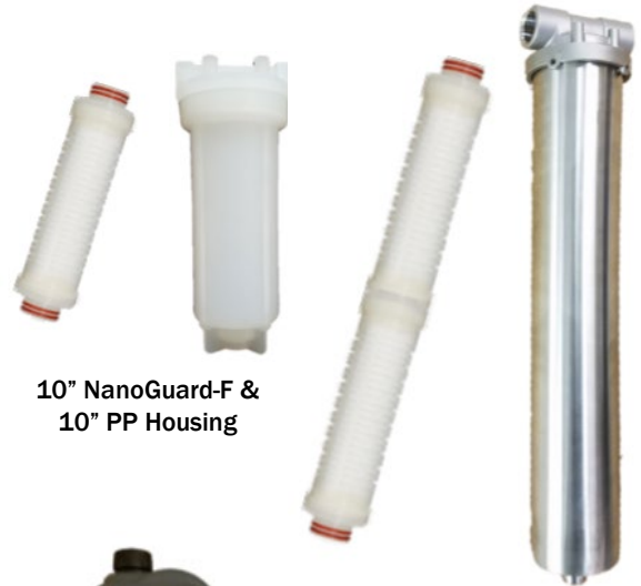
10" NanoGuard-F & 10" PP Housing