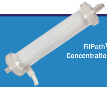
FilPath™ Concentration Filter