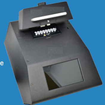
Portable, Programmable qPCR Thermocycler