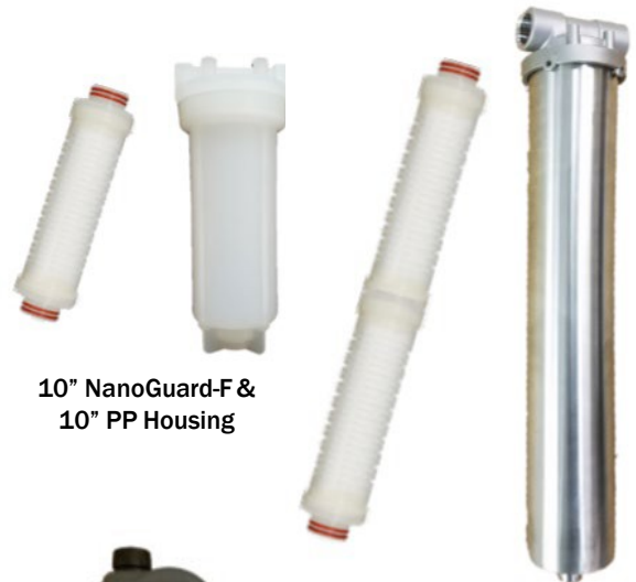
10" NanoGuard-F & 10" PP Housing