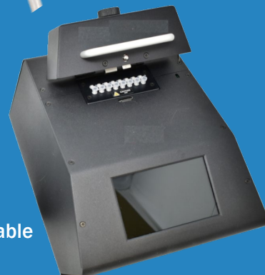
Portable, Programmable Thermocycler

Perform 15 separate DNA/RNA assays from a single 1 liter water sample in approximately 1 hour