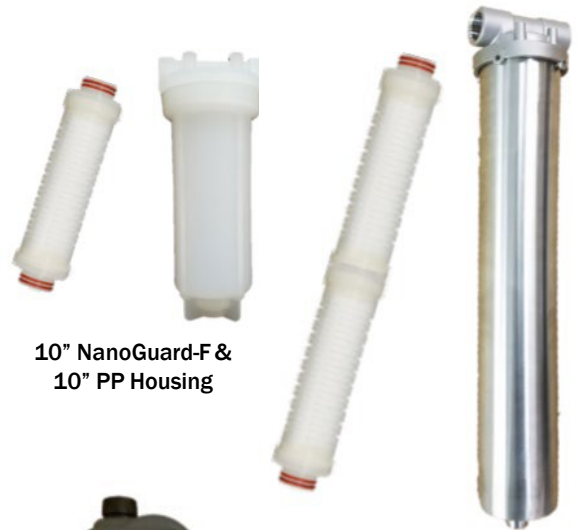
10" NanoGuard-F & 10" PP Housing